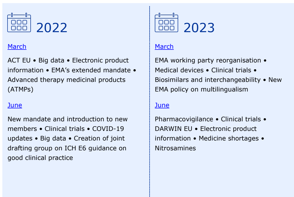
Table 1: PCWP involvement during 2022 and 2023

Table 1 provides an overview of the topics in which the PCWP was involved during 2022 and 2023. Many of the meetings are held in conjunction with the corresponding HCPWP as several subjects covered are of mutual interest and relevance. This is not only consistent with our multistakeholder approach but also results in better outcomes.