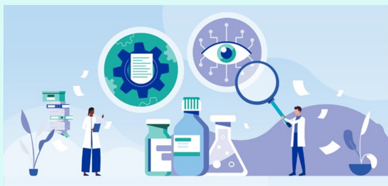
Image 1. The ACT EU programme will host multi-stakeholder events on a variety of clinical trials topics throughout 2022 and 2023

The ACT EU programme will organise a series of workshops on the third revision of the ICH guideline on Good Clinical Practice (GCP), known as ICH E6 (R3). The ICH E6 (R3) guideline describes the responsibilities and expectations of all stakeholders in the conduct of clinical trials, and covers monitoring, reporting, and archiving of trials. The revision to the guideline aims to provide GCP guidelines that are responsive to current clinical trial practices, acknowledging the diversity of trial designs, data sources, and